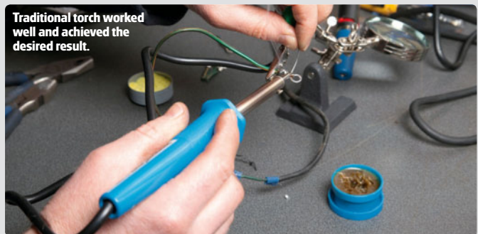
Traditional torch worked well and achieved the desired result.